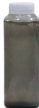
Reclaim system water using chemical products that are not reclaim compatible.