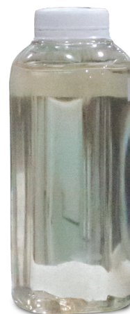
Reclaim water using VTL reclaim compatible products.

The growing insoluble residues make it difficult for the good bacteria in your system to work. The most noticeable result is a noxious “rotten egg” odor. Ver-tech Labs reclaim compatible products will prevent the problems noted above from occurring in your car wash. Even if the car wash has been using non-reclaim products, simply switching over your car wash product line to Ver-tech Labs chemicals will correct the problems and eliminate the odors within days.