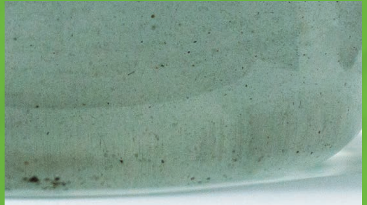
Reclaim system water using reclaim compatible products.