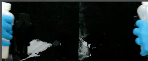
Both products appear to be rinsed off the surface.