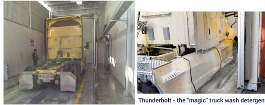
Thunderbolt - the "magic" truck wash detergent

Tonka HD high pH detergent for touchless cleaning