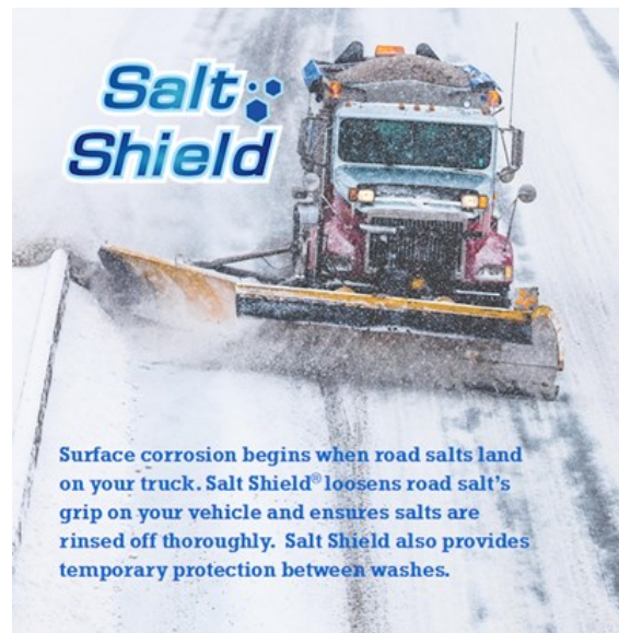
Surface corrosion begins when road salts land on your truck. Salt Shield® loosens road salt's grip on your vehicle and ensures salts are rinsed off thoroughly. Salt Shield also provides temporary protection between washes.

In 2009, a large Midwest trucking company began to use Ver-tech Labs products including Salt Shield exclusively in their routine wash procedures. Trucks are washed each time they return to the property from a daily or weekly trip. In the first three years, no corrosion was detected on vehicles washed exclusively with Ver-tech Labs products.